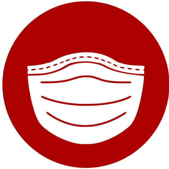
Wear a Mask